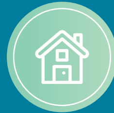
Non-Standard Home Environments